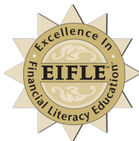
The Truth About Money

Every book a best-seller, including #1 The New York Times BESTSELLER