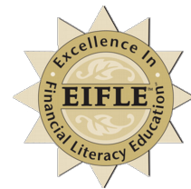
The Lies About Money